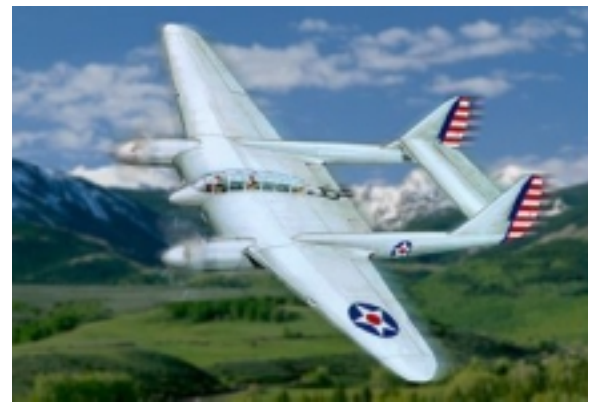
Figure 11. Artist rendering of the XBAB fighter bomber.

OA-1 was a completely new design it did maintain all of the salient features of the Burnelli lifting-body design principle. Unfortunately only one of the aircraft was produced.