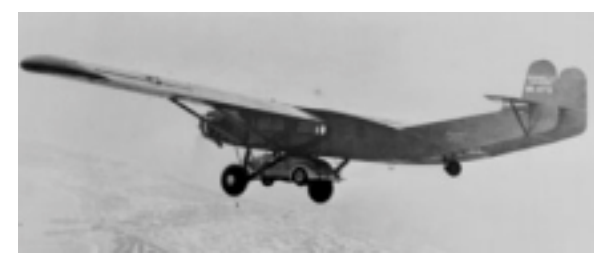
Figure 9. Photograph of the UB-20 lifting-body mono-plane.

body principle, but more noteworthy was that the GX-3 was the first twin-engine aircraft to have a variable area and variable camber wing <sup>71,78</sup>, full-span high-lift flaps<sup>78</sup>, winglets<sup>67</sup>, and pivoting wingtip ailerons<sup>67</sup>, see figure 8. Although the GX-3 arrived late for the competition and did not participate it did demonstrate its outstanding STOL performance capabilities <sup>10,46</sup>. The aircraft demonstrated take-off and landings of less than 300 feet and a landing speed as low as 30 m.p.h..