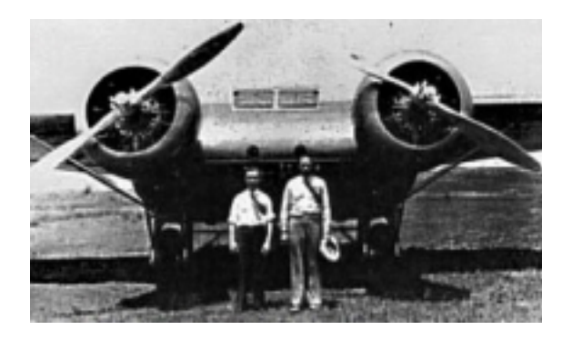
Figure 10. Photograph of the UB-14 lifting–body mono-plane.

Shown in figure 10 is Burnelli's next design, the UB-14 <sup>16,70,79</sup>. Built in 1934 the 14 passenger transport aircraft was similar in appearance and construction to the UB-20. The primary differences between the UB-20 and UB-14 were retractable landing gear and had an enclosed cockpit. Other differences included a tapered wing and partially exposed engines fitted with cowlings. As with his other designs the UB-14 had excellent load carrying capacity and STOL performance.