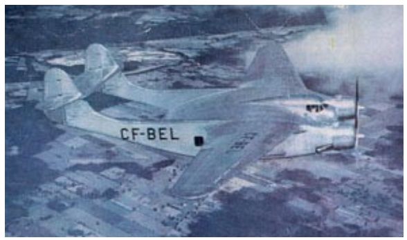
Figure 12. Photograph of the CBY-03 cargo aircraft.

In 1944 Burnelli was recognized by the aeronautics community when he received the Fawcett Honor Award for his "Major Contributions to the Scientific Advancement of Aviation". Over the next two decades he continued to design and innovate addressing such diverse technical issues as boundary layer control, flush inlets, jet propulsion, and all-wing designs for a two-person sport plane and a 1000 passenger transport aircraft <sup>94-102,108-116</sup>. A photograph of a Burnelli transport model is depicted in figure 13.