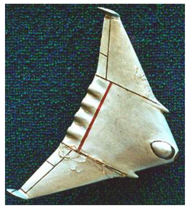
Figure 13. Photograph of a model of Burnelli's advanced transport design from 1951.

In 1944 Burnelli was recognized by the aeronautics community when he received the Fawcett Honor Award for his "Major Contributions to the Scientific Advancement of Aviation". Over the next two decades he continued to design and innovate addressing such diverse technical issues as boundary layer control, flush inlets, jet propulsion, and all-wing designs for a two-person sport plane and a 1000 passenger transport aircraft <sup>94-102,108-116</sup>. A photograph of a Burnelli transport model is depicted in figure 13.