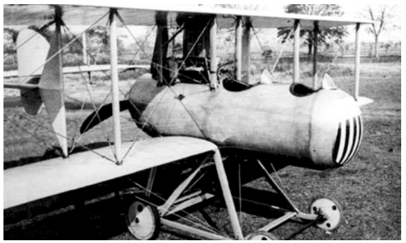
Figure 3. Photograph of the KB-1 Continental Pusher.

In 1916, at the age of twenty, he became the chief designer for the International Aircraft Company in Washington, D.C. and by 1917 he had joined the Continental Aircraft Company located on Long Island, NY as the chief engineer and superintendent. Between 1917 and 1918 he designed and built several successful aircraft, including the KB-1 Continental Pusher<sup>119</sup>, a military trainer (see figure 3).