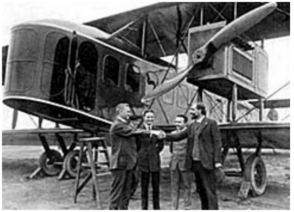
Figure 5. Photograph of the Lawson C-2 Air Line.

Besides being the America's first twin-engine commercial transport aircraft, it was also the first to have an enclosed cockpit for the pilot<sup>1</sup>. The bi-plane was very large, capable of carrying 26 passengers. Burnelli designed the fuselage with load carrying