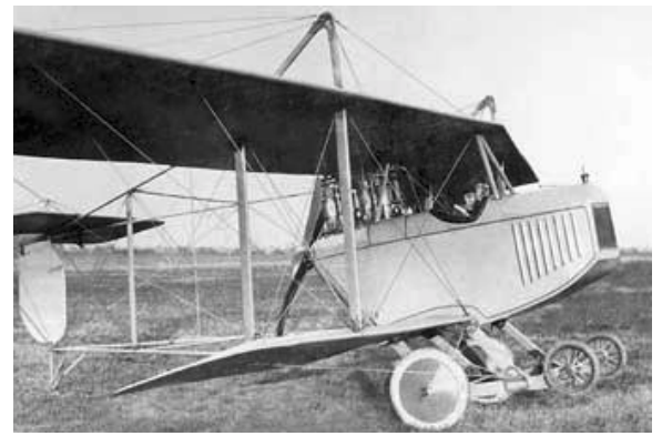
Figure 2. Photograph of the Burnelli-Carisi biplane.

By 1915 he had achieved acclaim as a champion model aircraft builder, a hang-glider and was the assistant technical editor of Aircraft magazine. He continued to pursue his dream in 1915 when he formed the Burnelli Aircraft Company in the hopes of developing aircraft for the government in response to World War I. He proceeded to design and construct his first powered aircraft with his friend John Carisi. The Burnelli-Carisi bi-plane, shown in figure 2<sup>118</sup>, was not purchased by the government, but it did become the first aircraft owned by the New York City Police Department.